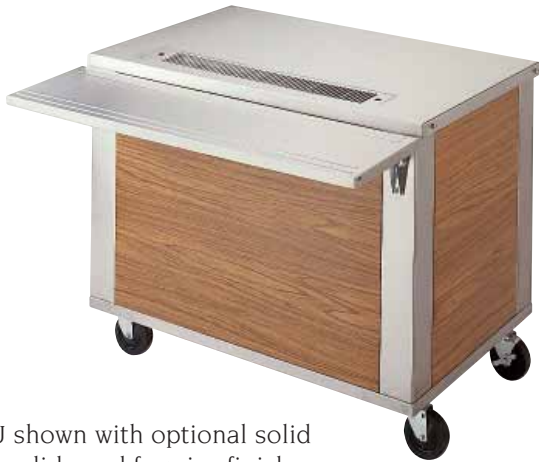
3-CU shown with optional solid tray slide and formica finish

The Elite 500 Beverage Counter Stand will accommodate a number of dispensers. The versatile modular design allows you to custom design your line-up, choosing only the options and accessories that you want and need. Elite 500 units are compatible and will interlock with other Elite 500 units. This allows the units to be disconnected for cleaning under the serving line.