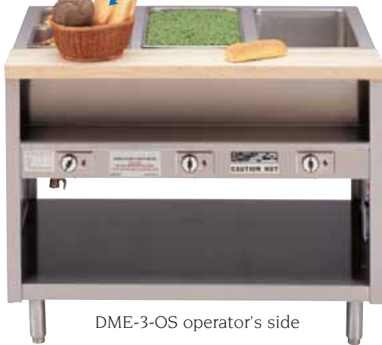
DME-3-OS operator's side

Pipermatic Stationary Hot Food Tables are designed to hold and maintain the temperature of hot food in various size pans for use in meal assembly on tray lines and cafeterias. Available with an optional extended, continuous perimeter bumper, this unit is designed to survive the rigors of typically heavy institutional use. The rugged, all stainless design insures years of easy cleanability and low maintenance use.