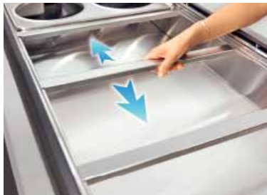
Adjustable adapter bars can be custom configured for many pan sizes and salad bar layout

The innovative "Cool Breeze" technology allows you to maintain product at 41 degrees Fahrenheit or less yet requires no ice. This Dropin unit cascades a "Cool Breeze" of air over the product without drying it out or causing freezer burn.