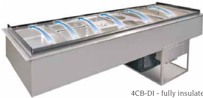
4CB-DI - fully insulated Cool Breeze Drop-in