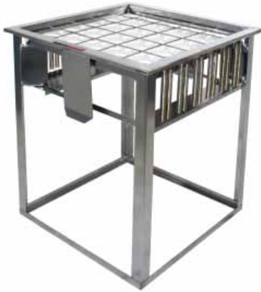
MODEL ADIF (DROP-IN)