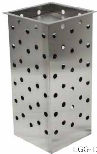
EGG-1212 Drop-in type