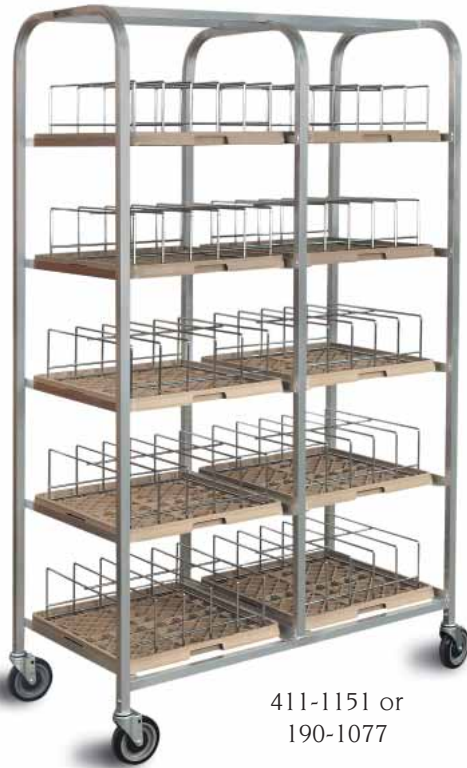
411-1151 or 190-1077

The Piper Dome Storage Carts are a practical way to store and dry plastic, plastic single wall and most insulated style domes. The molded underbases can be stored in the same fashion.