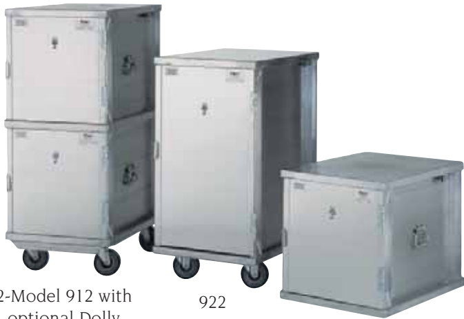
2-Model 912 with optional Dolly (2-2128) and chest handle