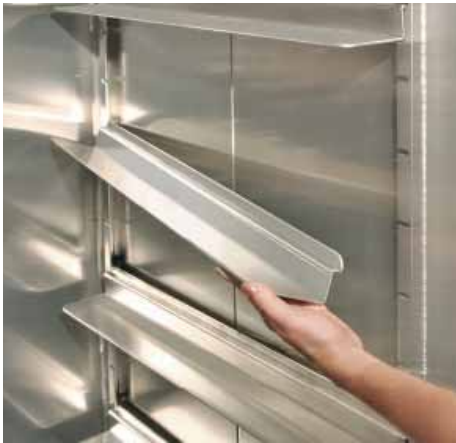
Universal glide easily adjustable